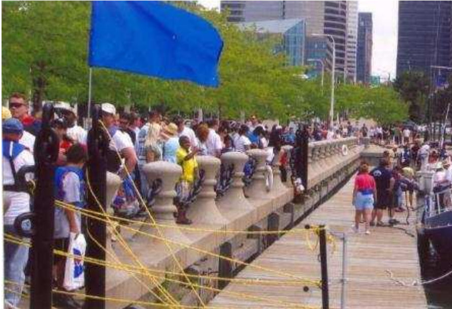
Visitors line the pier at the 2009 North Coast Harbor Boating & Fishing Fest.

If you are interested in participating, please contact the LEMTA office.