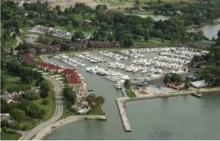
The Catawba Island Club from Lake Erie